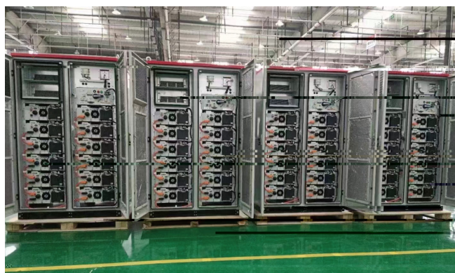
Figure 1: Project Photos

Located in 5 industrial parks, the 25 sets of JinkoSolar' s SunGiga liquid cooling storage system (ESS) coupled with renewable energy contribute to grid stability. In addition, the high price of electricity during peak period in Guangdong Province brings a considerable amount of electricity expenses to enterprises, so these 5.375 MWh products play a key role in peak shaving and valley filling.